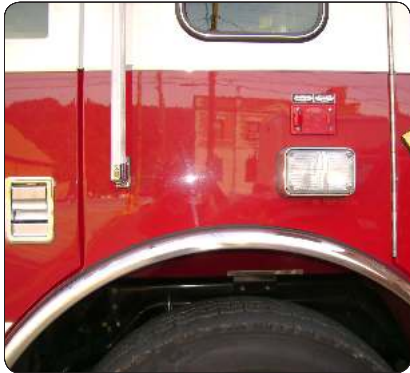
Above: EC Shine made this firetruck parade-ready Below: Welding shadows completely removed