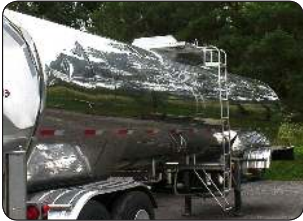
Tanker cleaned with EC Shine System