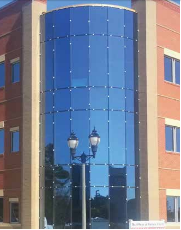
The Offices at Mayfaire NC - brick