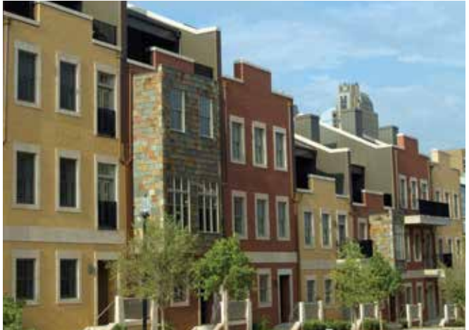
The Brownstones at Maywood Park OK - mutilple substrate