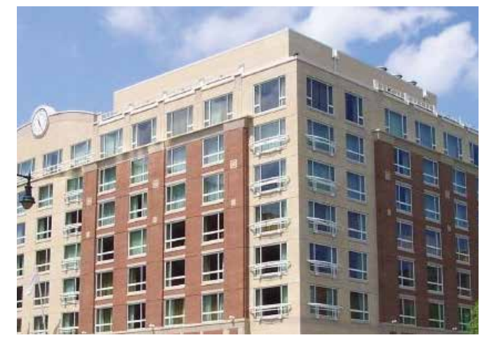
CambridgeSide Hotel MA - waterstruck brick, Arriscraft block

A powerful detergent-based solution designed for safe and effective removal of mortar smears and efflorescence from masonry surfaces. It can be used on all masonry substrates including brick, stone, synthetic stone, precast concrete, designer or colored block. The added buffering ingredients allow <u>NMD 80</u> to be powerful yet safe enough for glass and anodized aluminum.